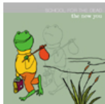
The New You (2004)