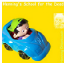
Henning's School for the Dead (2001)